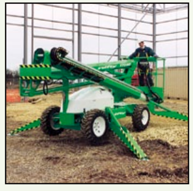
Also available on a self-drivable 2x4 or 4x4 base, the Nifty 170SD .