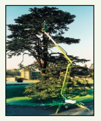
The 170's outstanding reach makes it ideal for a wide range of applications.