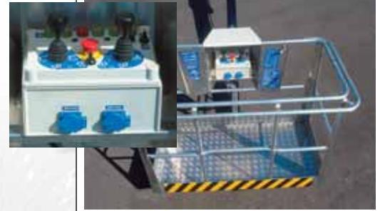
The basket of the DINO 260XT is spacious. Stepless control of boom movements is possible with two joysticks.