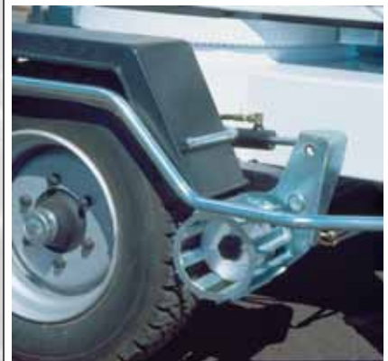
The drive mechanism enables the DINO 260XT to be moved easily around the job site. The system is switched on hydraulically.