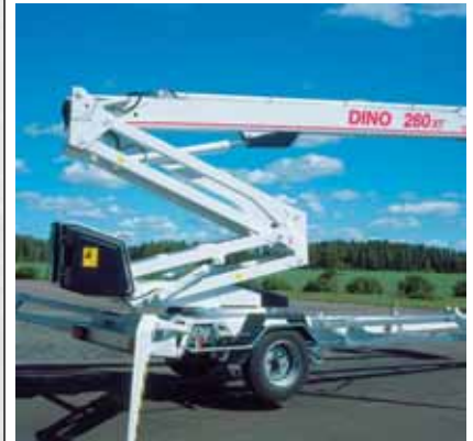
The DINO 260XT has a riser that gives the unit an up-and-over capability.